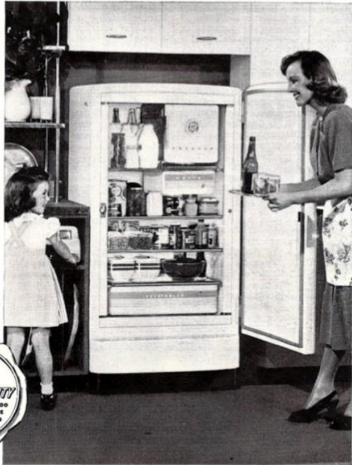
Model NB 8 G illustrated.